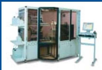
Figure 4. The Ettan Spot Handling workstation represents an integrated 2-D MS platform for proteomics analysis consisting of instruments, chemicals and software.

the gel because hydrophobic membrane proteins or tissue proteins act differently than do other proteins. It is important that the protein be soluble before 2-D electrophoresis separation. Various inorganic and organic buffers must be added to disrupt disulfide bonds and noncovalent interactions (18).