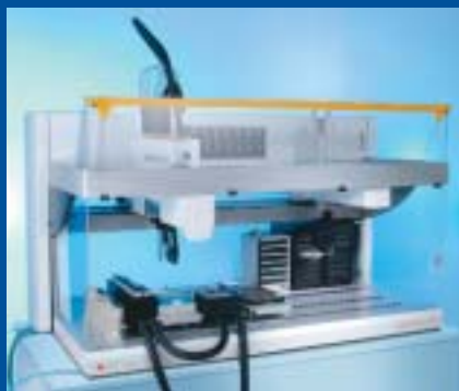
Figure 3. The ProTeam Digest workstation automates sample processing (digestion, desalting and concentration) and spotting onto the MALDI target plate.